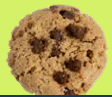
Caramel Chocolate Chip