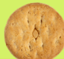
Peanut Butter Sandwich