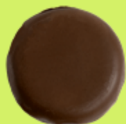
Peanut Butter Patties