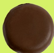
Peanut Butter Patties