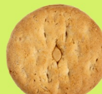
Peanut Butter Sandwich