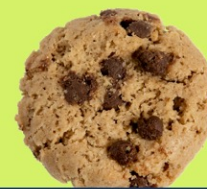
Carmel Chocolate Chip